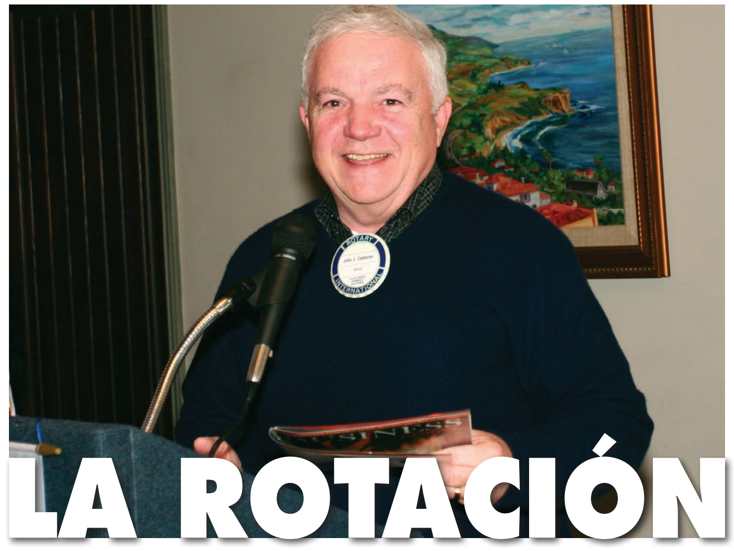
Rotary Club of Palos Verdes Peninsula · February 20, 2009